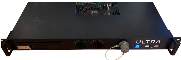
RCMS is an NSA-reviewed and authorized re-key system.